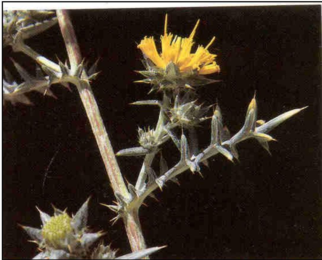
Figure 1. Berkheya rigida from Parsons and Cuthbertson (1992)

Description: A perennial thistle, stiff and woody, up to 80 cm high with a system of rhizomes. Stems are woolly below and may become prostrate and root at nodes. Leaves are green above, white woolly below, 5–10 cm long deeply lobed with spiny points, basal leaves tapering to the base and virtually sessile, while upper leaves may clasp the stem. Flowers deep yellow, florets all tubular in heads 2–3 cm across, subtended by several rows of spiny bracts. Seed up to 3 mm long, black, smooth, conical, with terminal scales but no pappus.