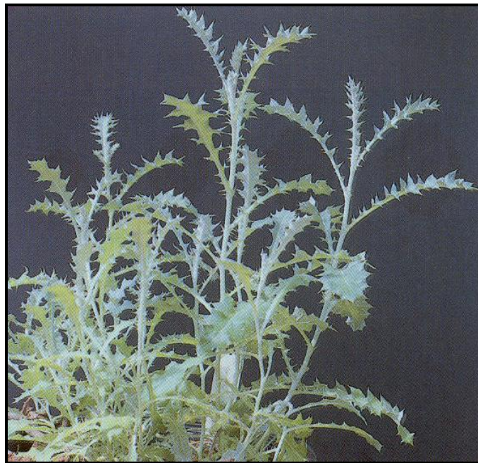
Figure 3. Berkheya rigida from Parsons and Cuthbertson (1992)