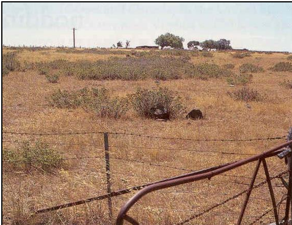
Figure 5. Infestation of Berkheya rigida from Parsons and Cuthbertson (1992)

Distribution: Native in South Africa. Naturalized in Australia (NGRP, 2002).