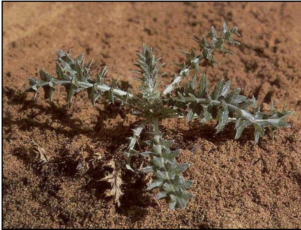
Figure 4. Berkheya rigida seedling from Parsons and Cuthbertson (1992)