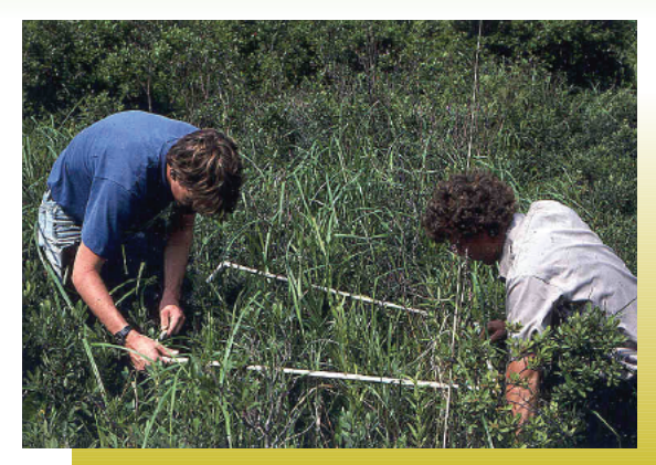
Efforts to reduce purple loosestrife's effect on Acadia National Park have been successful.

Each year, researchers sample seven permanent monitoring grids to count reproductive and non-reproductive purple loosestrife plants. Over a 16-year period, data shows a steady decline of purple loosestrife stems in each grid. But even with Acadia's success, unmanaged purple loosestrife populations are increasing rapidly just outside the park. Because invasive plant management remains a long-term commitment in the park, officials have expanded their management program to include other invasive species, such as alder buckthorn (Rhamnus fragula) and garlic mustard (alliaria petiolata)