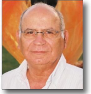
Baruch Rubin Outstanding Teacher Award