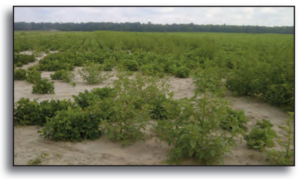
ALS-resistant smooth pigweed in Lima beans. A lot of that pigweed you see is due to a sprayer skip.

We visited four locations in Delaware and Maryland. The first stop was at the University of Maryland Wye Research Farm where the group viewed conventional and herbicide-resistant weed research plots and discussed selectivity of herbicides as well as the need for herbicide programs designed for